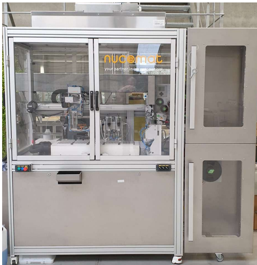
Front view of the filler unit.

Nucomat has engineered a compact and flexible automated platform for unattended vial dispensing provided inside a safety enclosure. This unit is ready for installation and just requires your input settings and a user training to get you going with accurately filling batches of research grade reagents and kit solutions in screwcap vials.