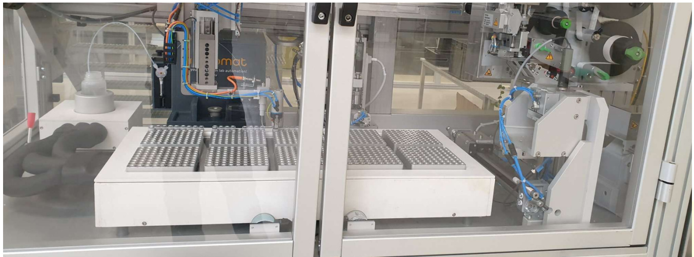
Front output rack view, with the cartesian vial gripper positioned left in front of the dispenser unit. Label printers on the right.